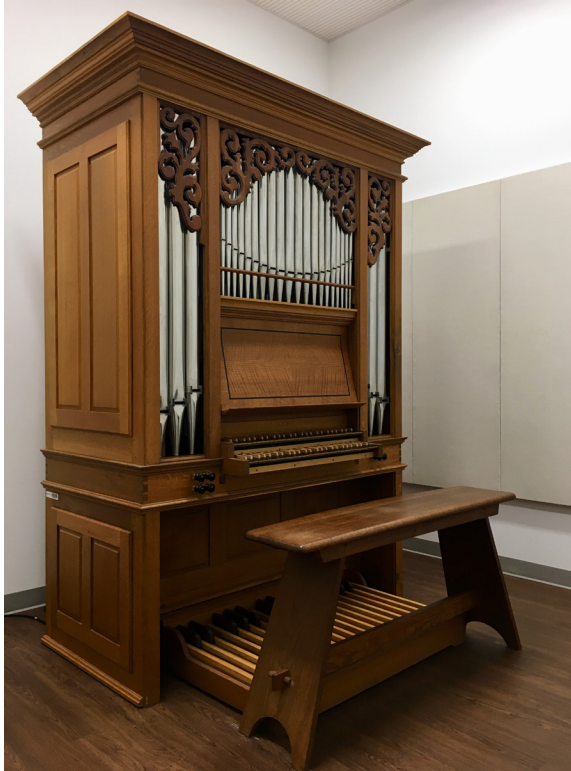
Jaeckel Organs, Op. 12B (1988) Two Manuals, Six Stops, Five Ranks, 254 Pipes