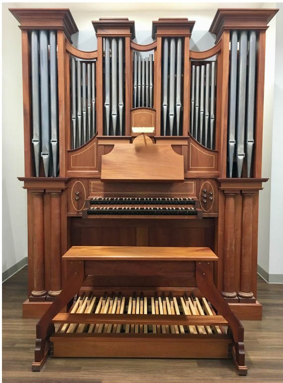
Schreiner Pipe Organs, Op. 2 (1995) Two Manuals, Five Stops, Four Ranks, 204 Pipes